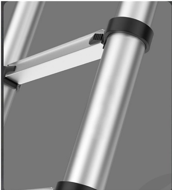
Aluminum Tube Without Interface

Semi-Automatic PET Bottle Blowing Machine Bottle Making Machine Bottle Moulding Machine PET Bottle Making Machine is suitable for producing PET plastic containers and bottles in all shapes.