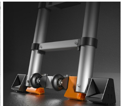
Bottom Balance Bar

The bottom of the ladder comes with triangle reinforcement to enhance the stability and reliability of the ladder.